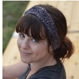
"Split the Baby: Two Sides of an Adoption Battle" Olivia LaVecchia City Pages